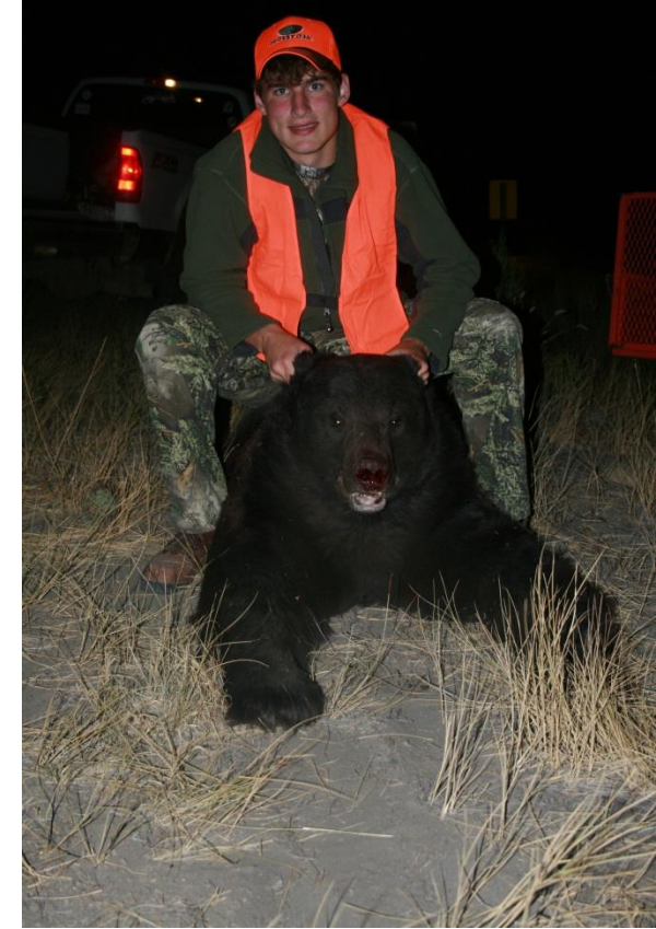
Trophy Boar topped 500 lbs.

wisenhour@lonestaroutfitters.com www.lonestaroutfitters.com