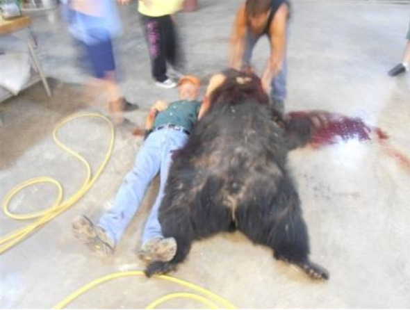
Trophy Boar over 6 ft. square